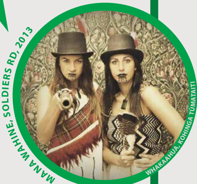
MANA WAHINE, SOLDIERS RD, 2013 WHAKAAHUA, KOHINGA TŪMATAITI

HE AHA TĀ TE RINGA TOI I WHAKAKORO AI, KĀORE RĀNEI I WHAKAKORO KI TE KĪ AKE MŌ TE NOHO HEI MĀORI?