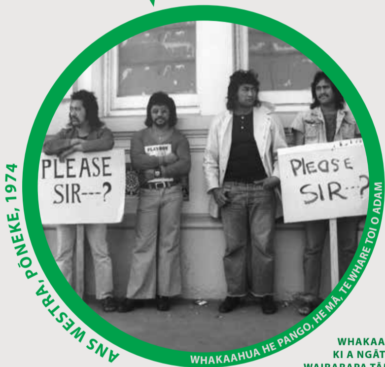
ANS WESTRA, PŌNEKE, 1974 WHAKAAHUA HE PĀNGO, HE MĀ, TE WHARE TOI O ADAM

Kua whakamahia e Westra the wā tonu me te aho e taurite ai, e tata hangarite ai te whakaahua. Tokotoru ngā tāne e titiro kē ana i te kāmera, kotahi e titiro hāngai ana. E hiahia ana a Westra kia mau tonu tā tātou titiro ki ngā kupu 'Please Sir' o te kiriata 'Oliver!' ka whakahāngai ai i tō tātou mōhio mō taua kiriata ki te tohe a ngā tāngata nei.